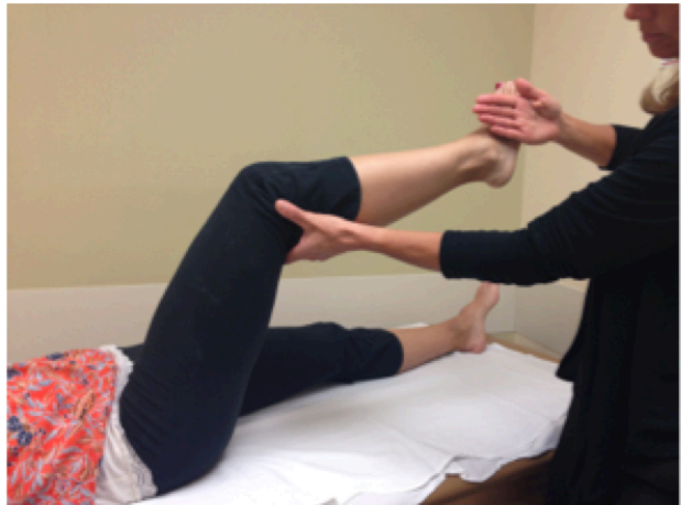
Isometric hip IR (internal rotation)

Isometric - contraction of the muscles without moving the joint and without elongating or shortening the muscle.