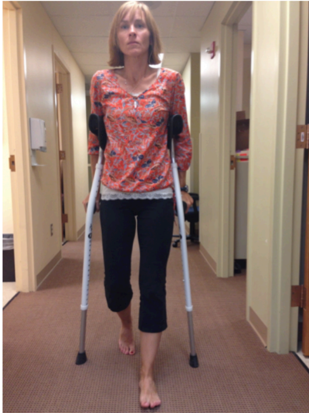
Proper technique, using BOTH crutches