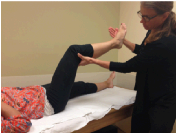
Isometric ER of the hip (external rotation)