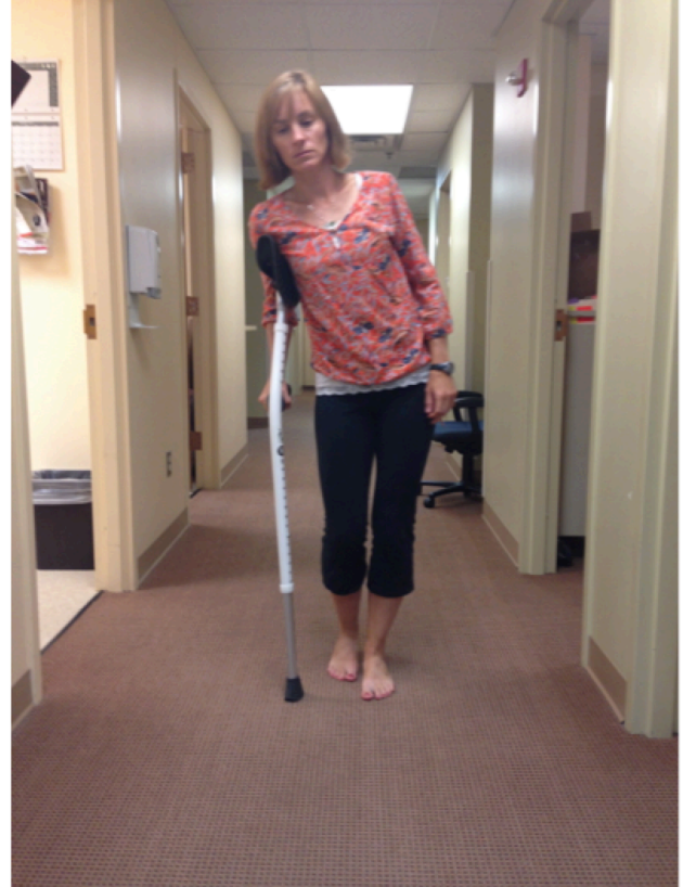
One crutch: Please avoid!!

Once you have been cleared for full WB, it is advisable to continue to use the crutches when walking long distances (>200 yards) or if your hip feels inflamed and sore. This is only until you get strong enough, usually 6-8 weeks after surgery.